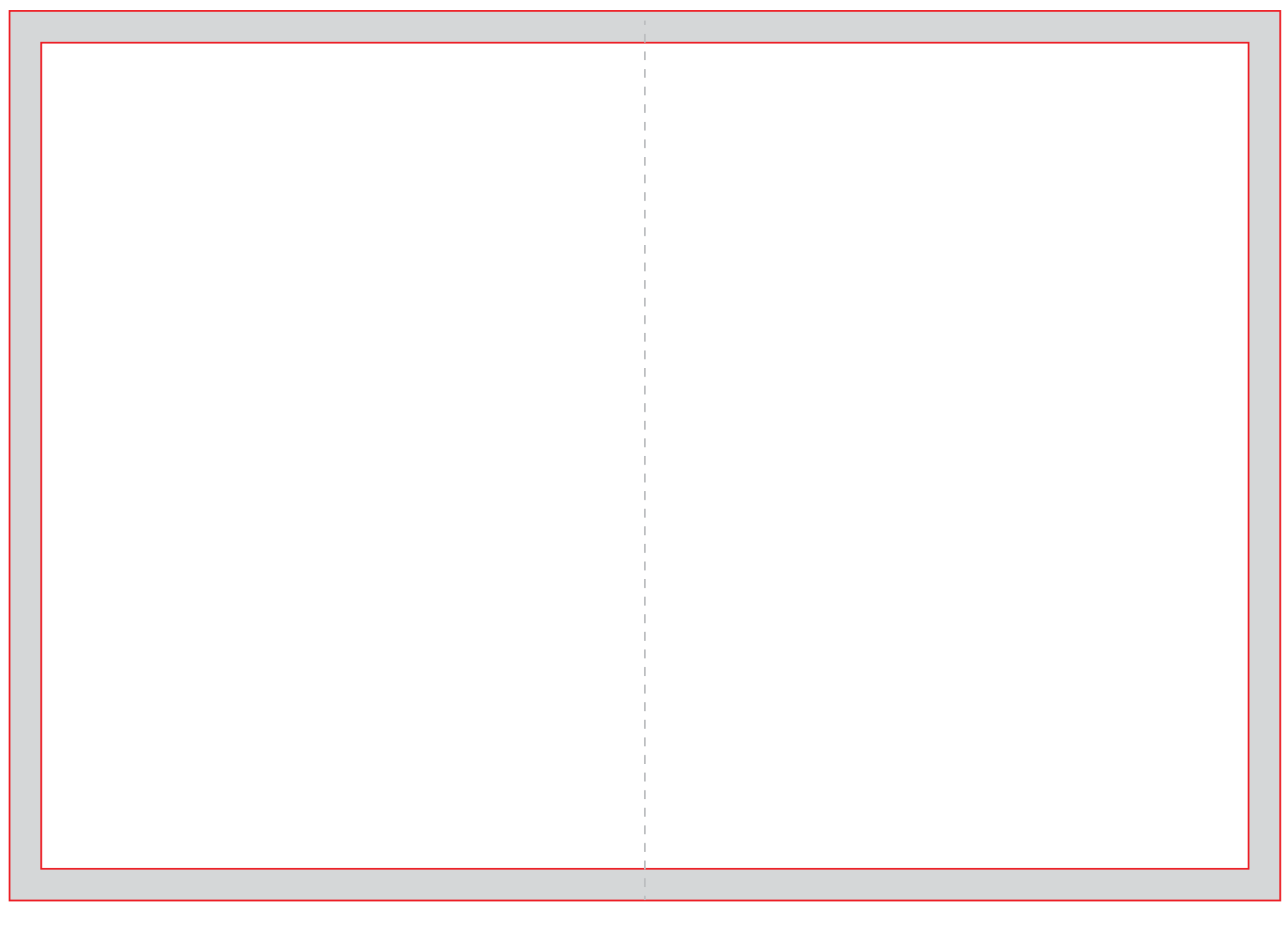
Step 2: Form the card

Fold the gold and white paper in half widthwise. Match the creases of the two pages, centering the white paper inside the gold paper, and glue together.